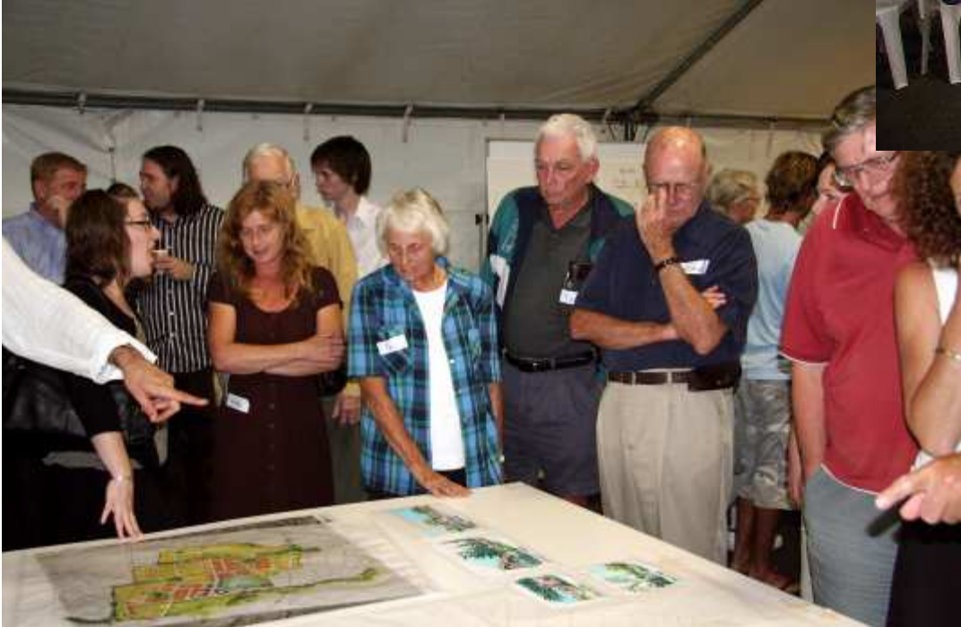
Case Study Example