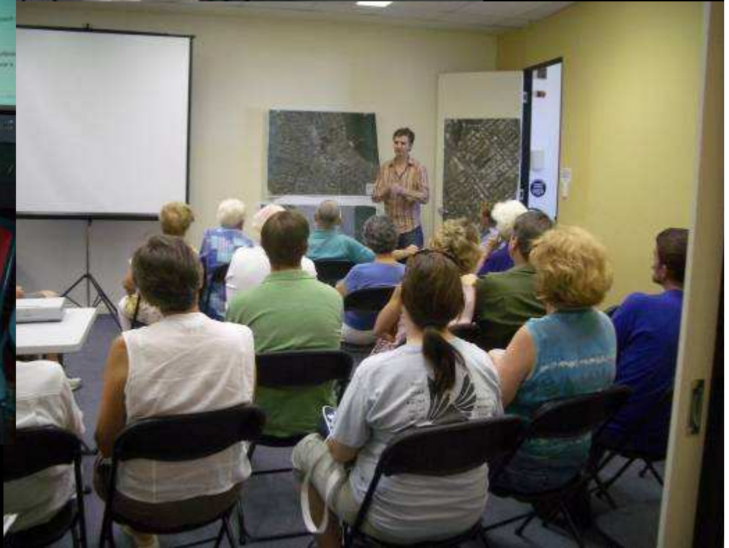
Case Study Example