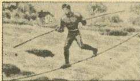
Mr. Blondin practising

Charles Blondin, acrobat, today performed the incredible stunt of crossing the Niagara Falls on a tightrope high over the water, balancing precariously on stilts. He made several trips across, one of